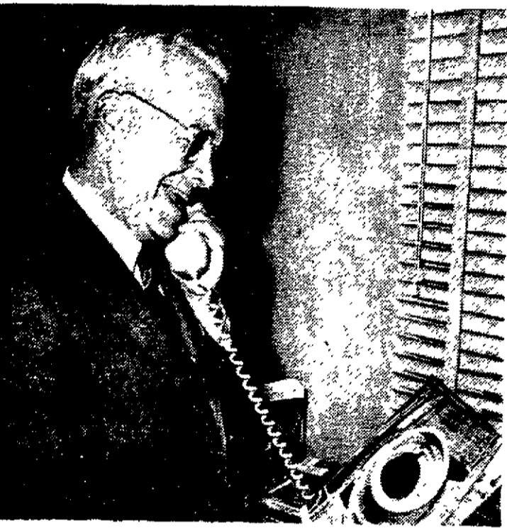
GOOD NEWS — Atlanta Mayor Ivan Allen, Jr. wears a happy smile as he calls friends to give them the news of the Milwaukee Braves' decision to move their National League franchise to Atlanta next season.

The United States had a lead of 86-64 going into this next-to-last full day of competition in team comparisons are discouraged. The United States, which got surprising support from its shooters, also got some surprise help from its canoeists, who prevented an anticipated shut-out in medals today.